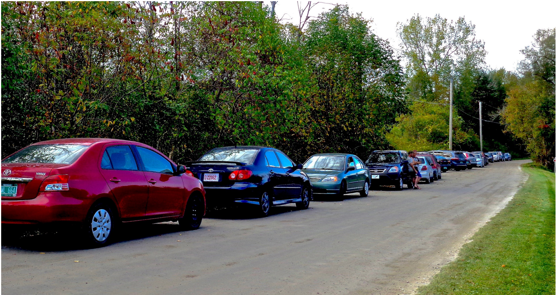
Cars along Coburn Road, September 27, 2017