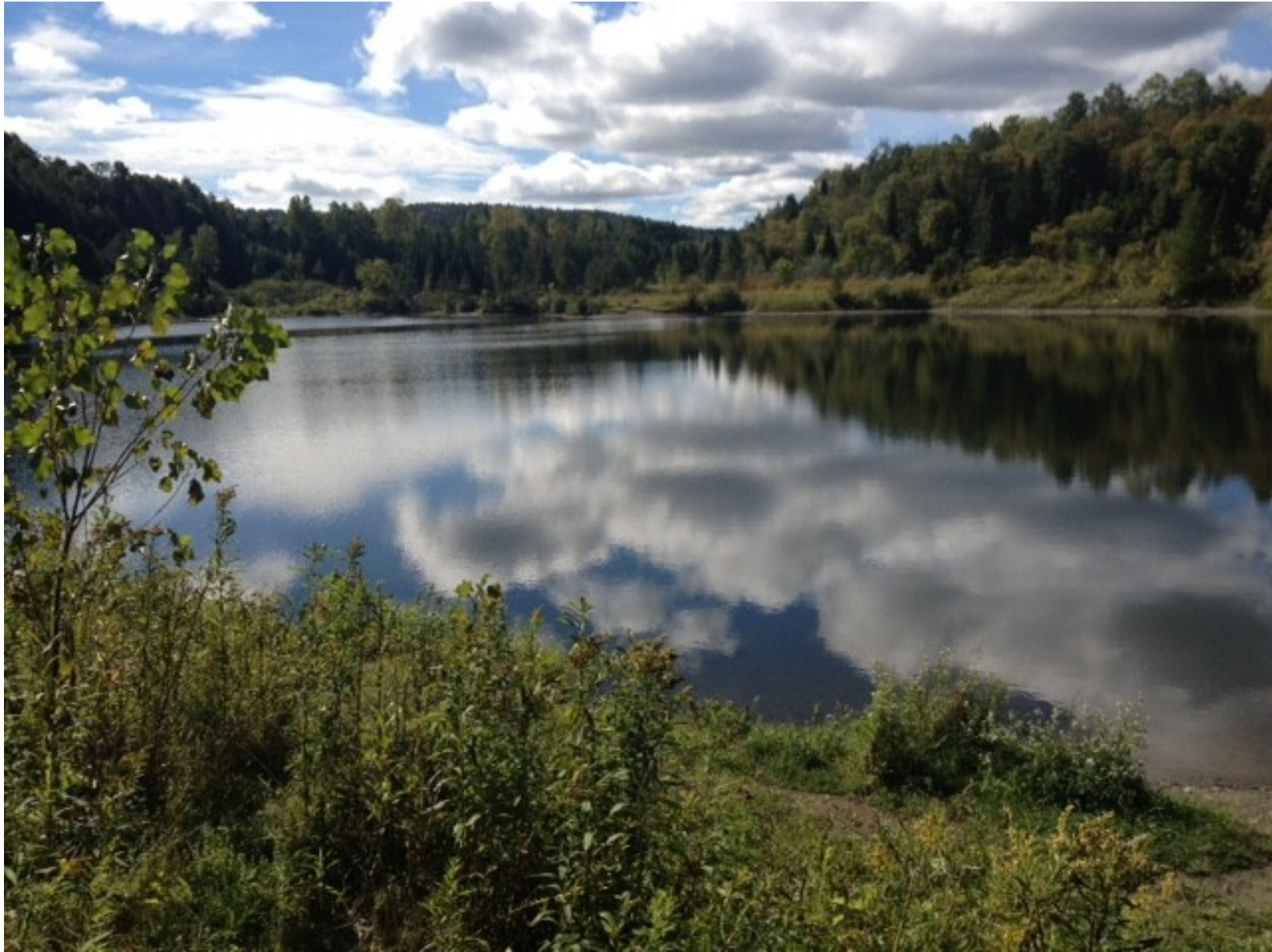
View to the south, September 27, 2018