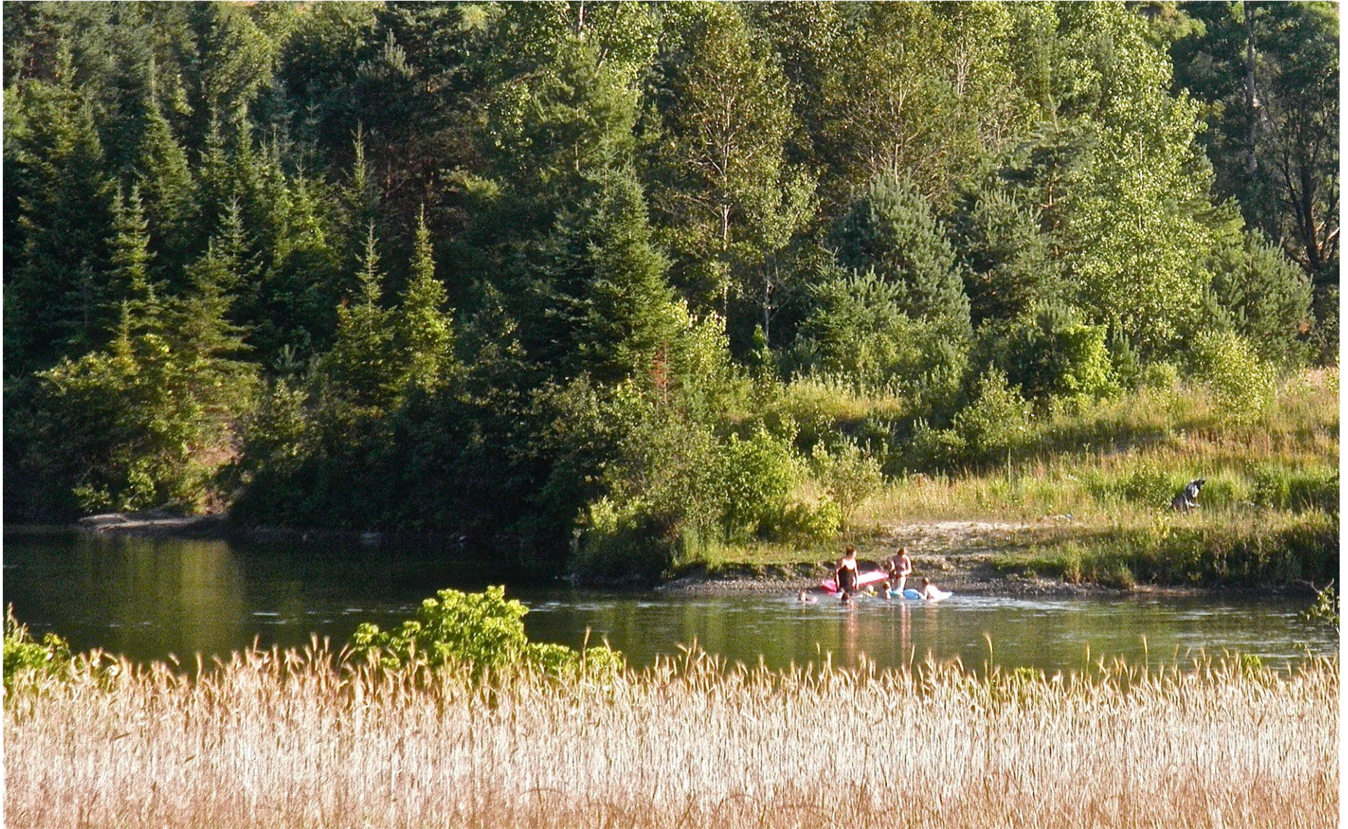
Family enjoying the south beach, July 7, 2012