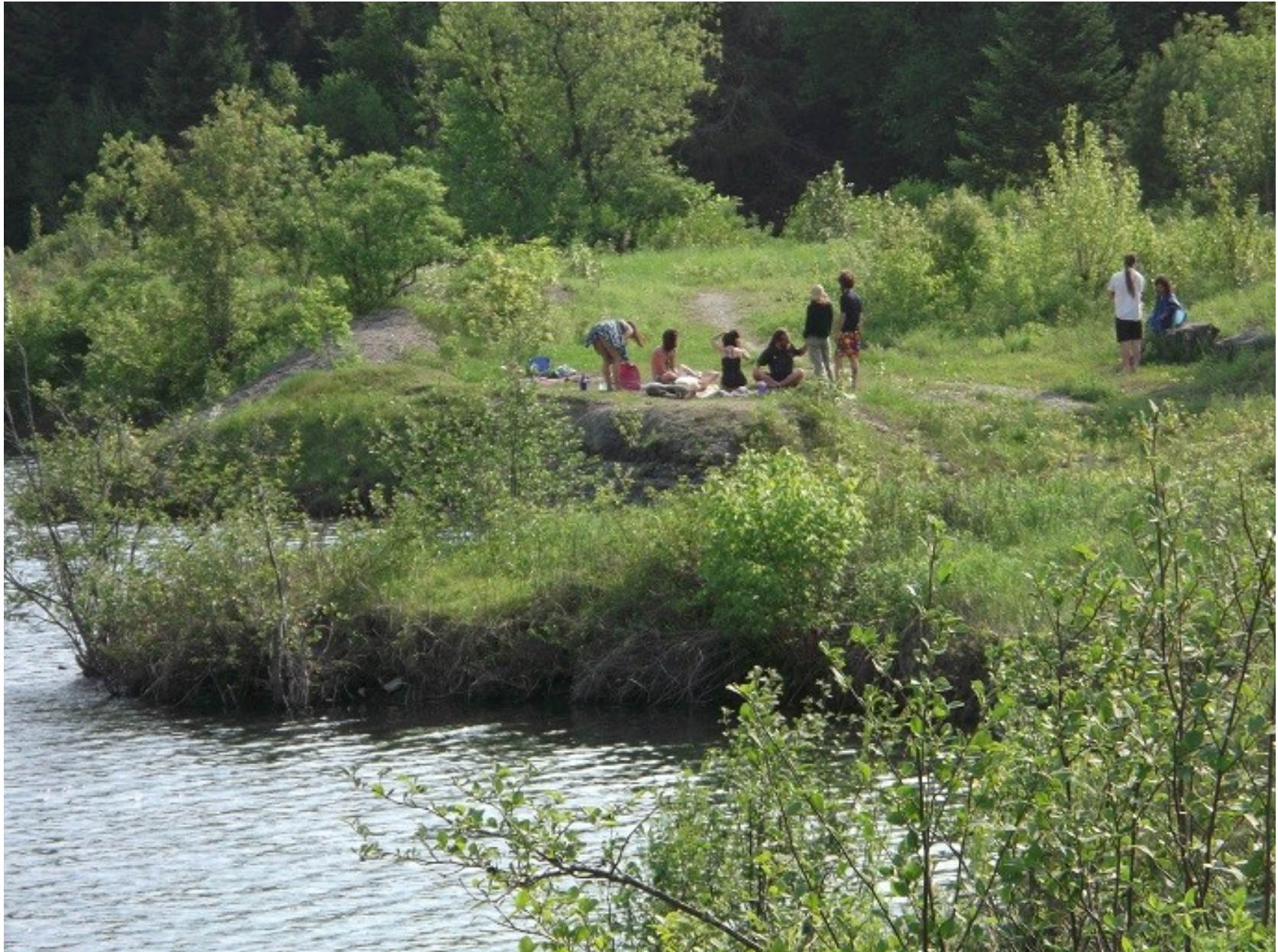
Picnickers at the cove beach, May 28, 2018