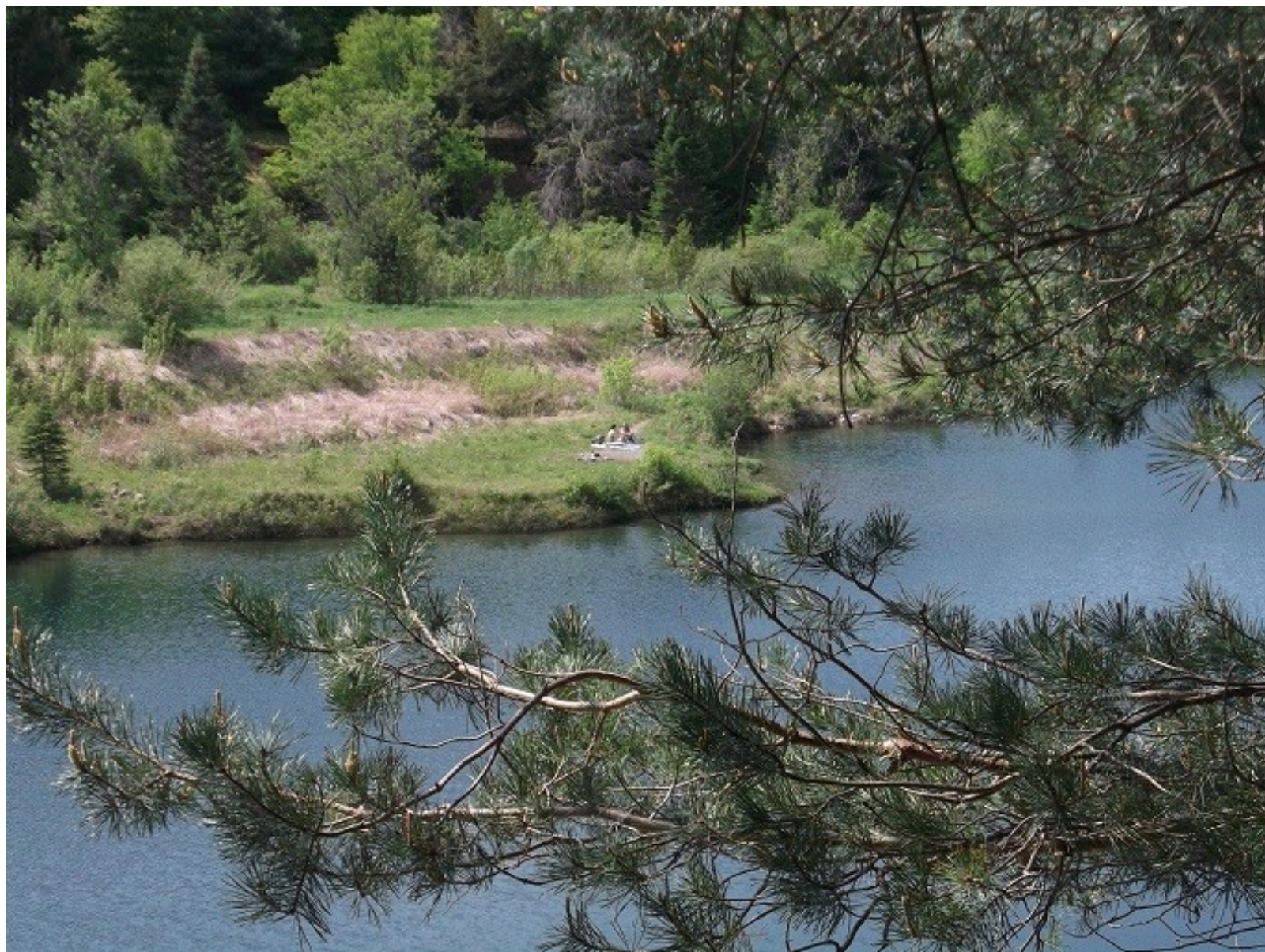
View from the eastern slope to picnickers at the south beach, May 28, 2018