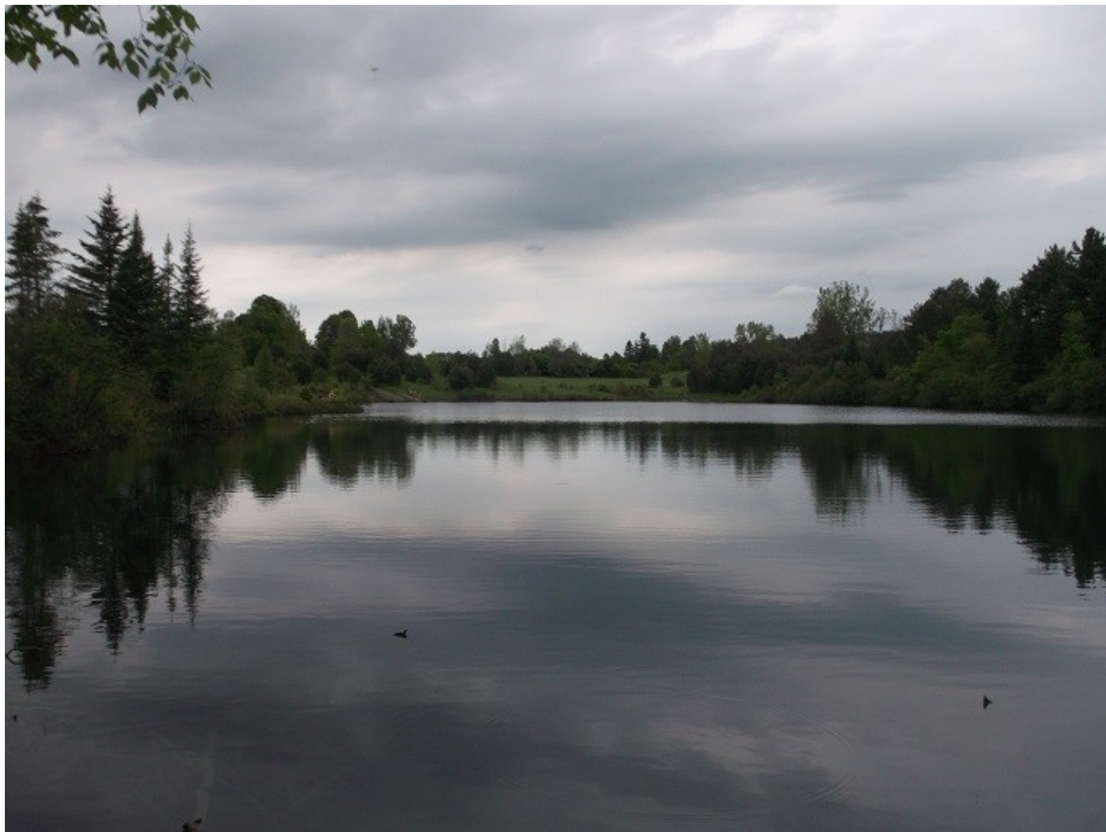
View to the north, May 28, 2018